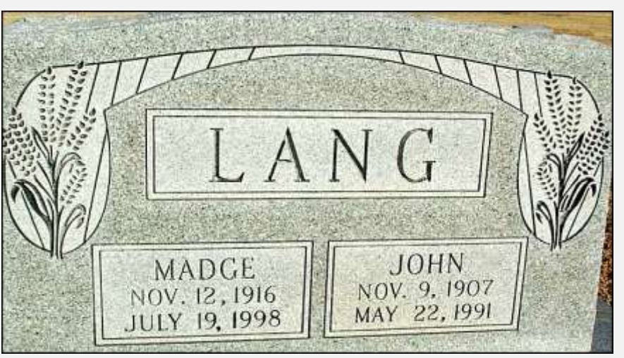
PRAIRIE VIEW CHURCH OF THE BRETHREN CEMETERY Scott City, Scott County, Kansas