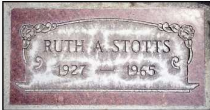
FAIRVIEW CEMETERY Scottsbluff, Scotts Bluff County, Nebraska