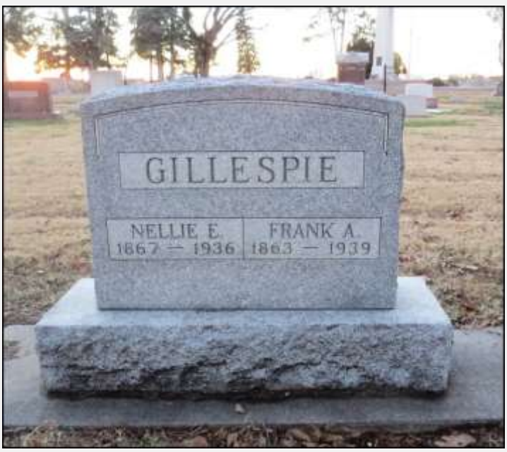
FRANK & NELLIE (GERBERICH) GILLESPIE

VALLEY VIEW CEMETERY Garden City, Finney County, Kansas